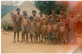
One of the Tribal Orphan Children Group Whose parents Were Killed In Wild Animals Attacks.