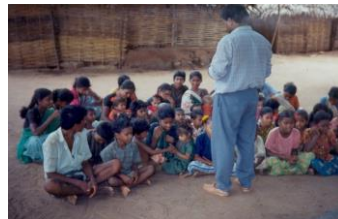
One Of The Several Outreach Evangelical Tribal Villages.