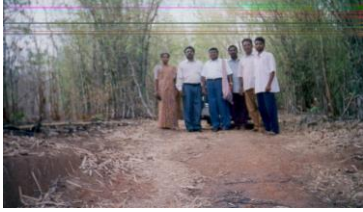
On one Out Reach Ministry