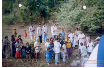
One of the Occasions of Baptisms