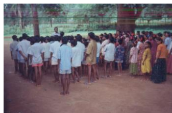
Gospel to school children