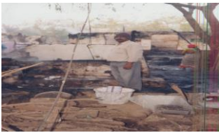
Tribal Villages One Fire Destruction.

It Professed: Isa 41:31 says "But they that wait upon the Lord shall renew their strength ; they shall mount up with wings as eagles; they shall run, and not be weary; and they shall walk and not faint." & in Dan 11:32b "But the people that do know their God shall be strong and do exploits;"