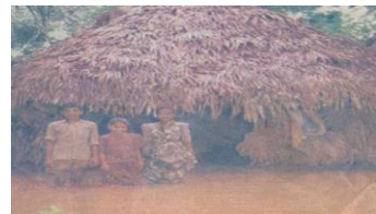
Floods In Tribal Villages.

Our Vision Statement is: "NONE should perish and ALL should Repent (2peter 3:-9)"Reach the Gospel and Salvation plan to the UNREAHED.....!.