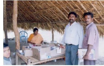
Free Medical camps

There are many experiences, that I/we have escaped from terrorist- police gun points, wild animals attacks but faced the Area people's black magic and had under gone medical surgeries. The LORD ALMIGHTY is so good to us and He protected us, against every danger. I wanted to work up to His expectations and die. So I wanted your esteemed Co-operation and support in from of anointed Gospel Speakers and Low Cost Church planting. We wanted you to Demonstrate....., your Spiritual Guidance, un Countable Leadership, Christian Compassion and Extend your Prayerful support to Build / Spread His Kingdom.