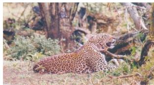
Leopard May Be Waiting For Its Prey.