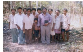
Some Of The Tribal Evangelists' Network (Nos.100)Evangelists From Our

We in India, Andhra Pradesh State, in the Tribal region called Rampachodavaram, (a Primitive Hilly Region, amid East-West-Visakha- Khammam Districts and amid Andhra/Orissa/ Chattisgarah Sates.....) also striving hard to do the best possible in the fields of Primitive Tribes Evangelism, soul winning and Low cost Tribal church planting . 15 years back, I have visited this place by a chance and was been apprised by their untold miseries. After having toured through these dangerous dense forest areas, I realized that theirs of these conditions are due to.....! AS THERES NO WORD OF GOD AMID THEM So ,I resigned my job and started working for Soul Winning. Soon few more persons joined me and formed in to a TEAM /organization and thus serving the cause. As