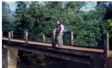
The Gospel infiltration

Greetings to you in His High and Most matchless name. As...You are elected, selected and anointed like Apostle Paul and thus, we are contacting you after many prayers. All of you in this mission as a team deserve great admiration for your very precious and splendid work that you been doing, since long in the Gospel Charities, especially in the Third and Fourth world countries, Where GOSPEL is".....UNREACHED.....!"