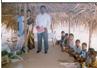
Tribal Children Feeding During Outreach In A Hut