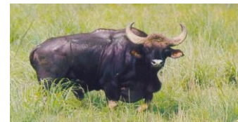
Dangerous Bison Looking At Us During Tribal Outreach.

Being confident of this very thing, That HE which hath begun a GOOD WORK in US (you) will perform it until the Day Of JESUS CHRIST (Phil 1:6)