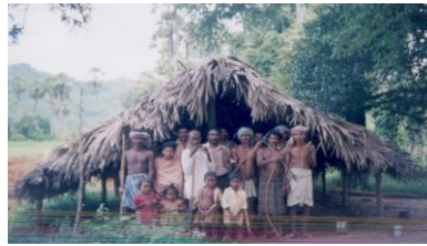
One of the Tribal Outreach Family.