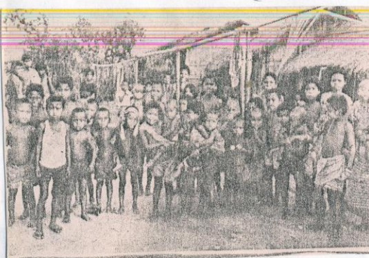
Tribal Orphan Children

ABOUT THE PLACE :- Ours is a thick intensified tropical rain forest area of 5681.74 Sq K.M nos. 1499 villages ,33 Kinds of Tribal Sects, with more than a half a million Primitive Hill Tribal People living. infested with many frightful animals, pythons, poisonous snakes/insects. Tall ever green trees, marshy - thorny bushes, hills, streams - lakes - waterfalls and valleys are splendid and add danger. Besides, Dreaded hardcore terrorists called Nauxalities, hide in these forests that fight against Government are the main hurdle and obstacles for any developmental activity. No Doctor and official of any sort don't come here as they are abducted and slained for their demands and so the Government efforts are in vain and halfway. Least infrastructure and Welfare activities thus completely neglected and the living conditions of people are worse than worst. No Gospel at all, no one knows about the TRUE SAVIOR